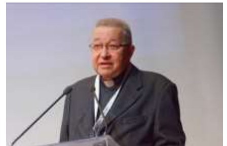
Monsignor André Vingt-Trois, Cardinal-Archbishop of Paris closed the Colloquium

In the evening of December 8 th , the 70 th anniversary of our Charter was celebrated at a mass presided over by Monsignor Eric de Moulins-Beaufort, Auxiliary Bishop of Paris, in the Church Saint-Augustin in Paris.