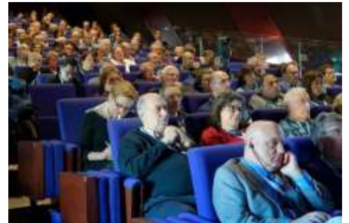
A full amphitheatre, an attentive audience of over 250 people from all over the world. All the correspondents were present!

4 half-day sessions enabled attendees to listen to talks and round-table discussions, given by numerous international speakers, as well as to see clips put together and filmed by Team members throughout the world ... The discussions were broadcast live and can be seen on www.equipes-notre-dame.com